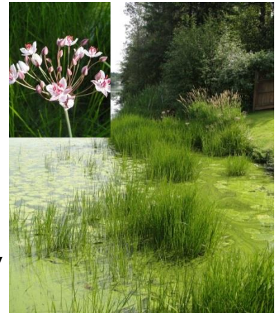
flowering rush in Bouchie Lk, Quesnel, BC