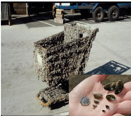
Zebra & Quagga Mussels