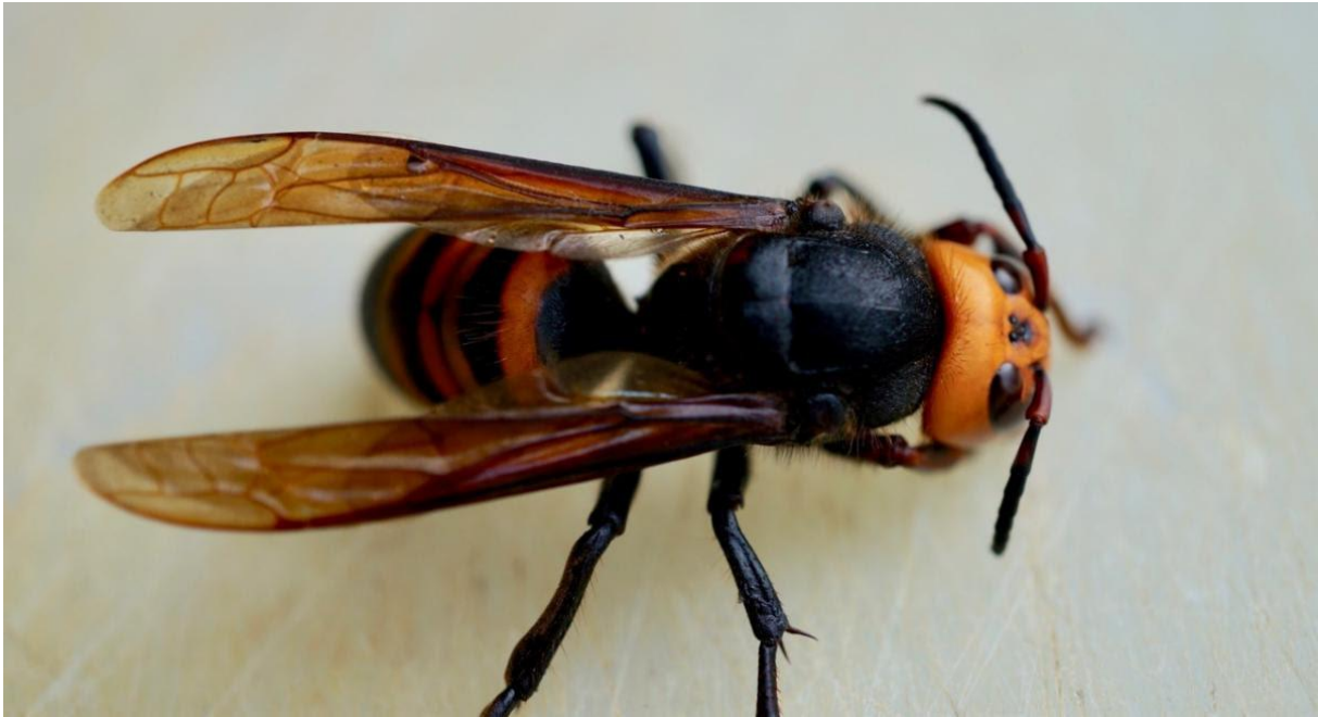
Northern giant hornet