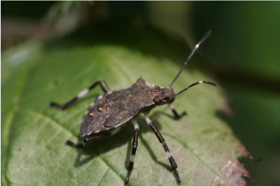
Brown marmorated stink bug