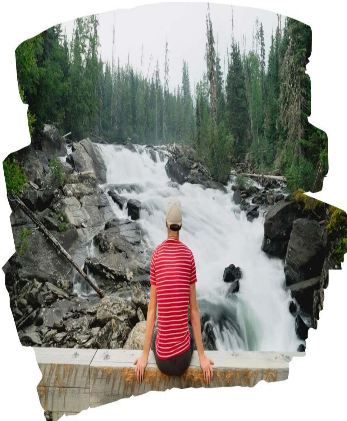
Waterfall along the Gold Rush Circle Route